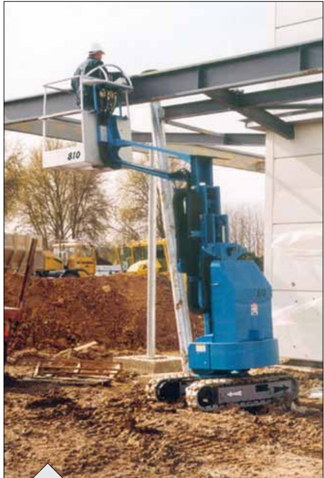
The heavy-duty construction of the ML810 and its true all-terrain capability makes it the ideal machine for rough and tough sites.