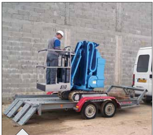
Weighing in at only 2.2 tonnes, the ML810 is very easily transported behind most tradesman's vehicles. A typical trailer package grosses at around 2.75 tonnes.