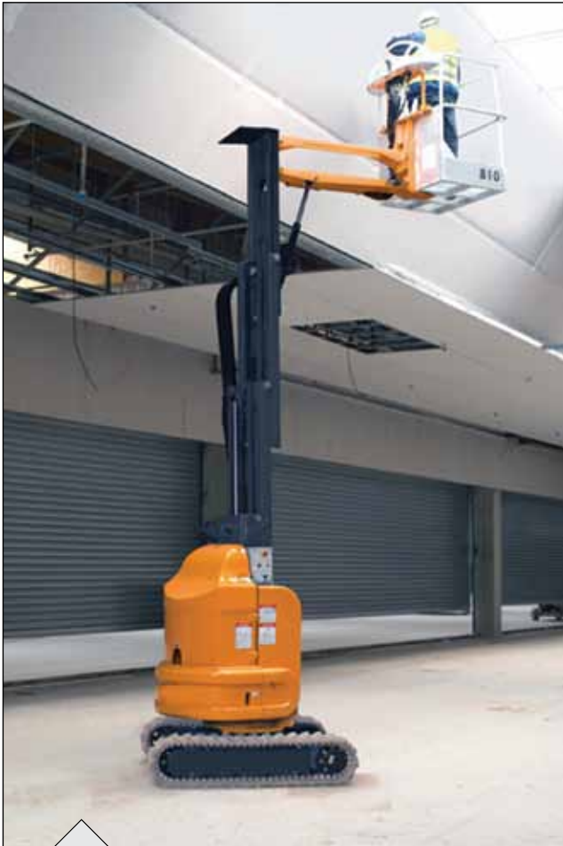
With gentle non-marking tracks, the ML810 is just as at home indoors as outdoors!