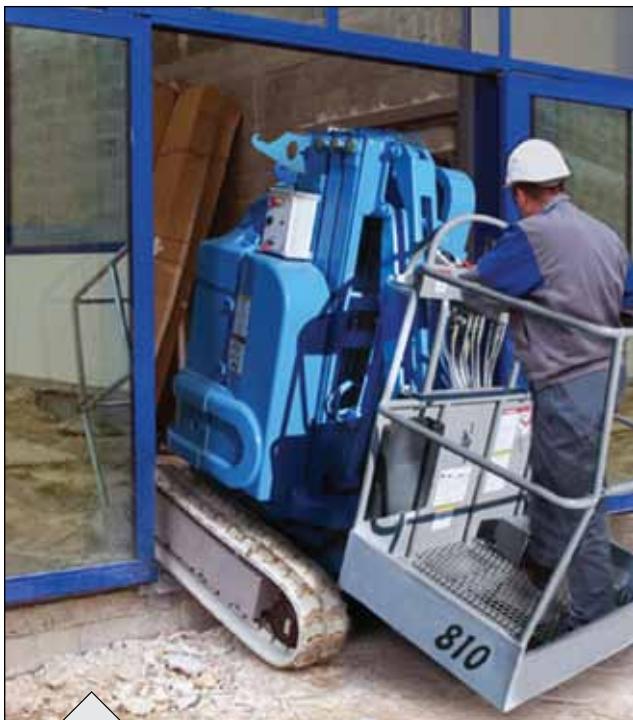
At only 1.2m wide and only 1.98m high, doorway access is easily achieved.